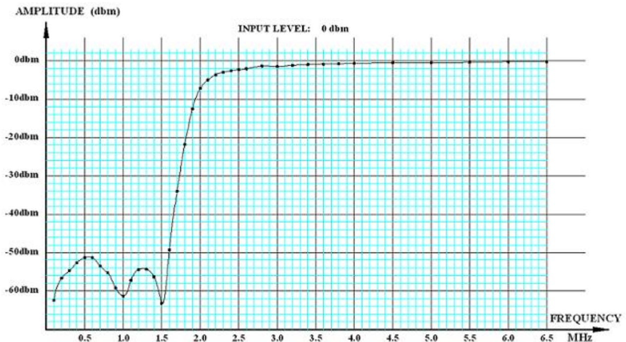
A TYPICAL HF BAND HIGH PASS FILTER RESPONSE (CORNER FREQUENCY 2.2 MHz)

A typical response plot of a HF High Pass Filter is shown below. This Filter is realized by a 7 th order Elliptic design, and has a (Customer specified) corner frequency of 2.2 MHz.