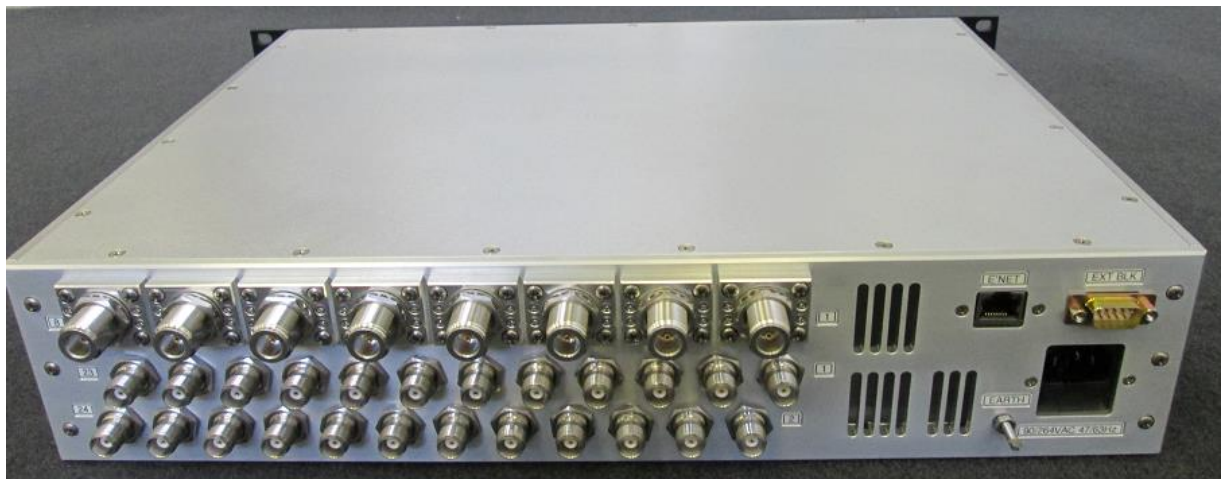
REAR PANEL VIEW - USC824 MATRIX SWITCH ( N INPUT CONNECTORS )

TOTALLY AUSTRALIAN DESIGNED AND MANUFACTURED