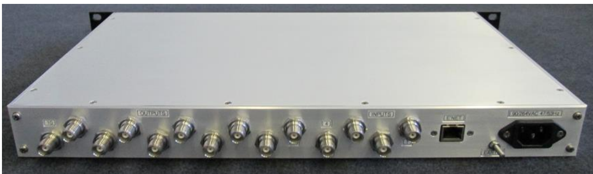
REAR PANEL VIEW - USC410 MATRIX SWITCH ( TNC INPUT and OUTPUT CONNECTORS )

TOTALLY AUSTRALIAN DESIGNED AND MANUFACTURED